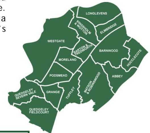
Lifelink service area

Lifelink staff can supply and fit a key-safe to your home. The key-safe comes with a 12-month manufacturer's warranty.